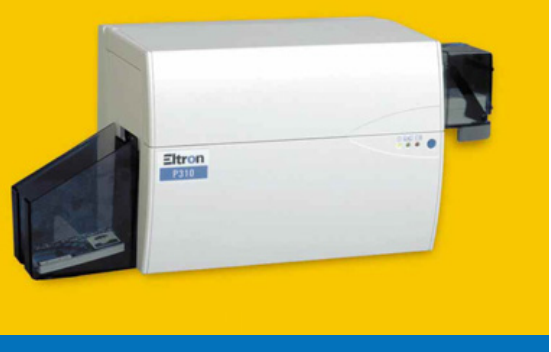
P310F SINGLE SIDED MONOCHROME

The P310F is ideal for applications requiring production of monochrome plastic cards, or personalizing pre-printed color cards. With the ability to print over 1,000 cards per hour, personalizing plastic cards has never been simpler, faster, or easier.